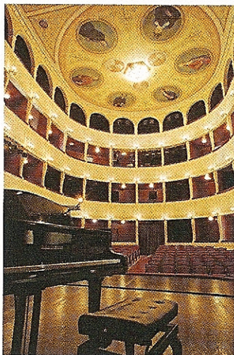
The Apollo Theater

The International Festival of the Aegean has become a fixture on the annual summer events calendar of the Cyclades—and one of the driving forces in the revival of the Apollo Theater since its reopening a decade ago. Launched in 2000 and now presenting its seventh consecutive season, the festival continues to extend its embrace beyond opera to theater and dance.